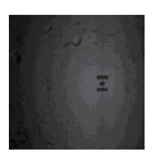
Hayabusa 2 tracking the target marker

became known upon arrival and maintaining a steady level of reliability. It was controlled through two methods: the Human in the Loop method which is based on commands from Earth, and autonomous functions of the spacecraft such as the event-driven control sequence function and artificial features such as target markers.